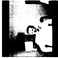
Police Chief Boots Reporter For Asking Senator About NDAAs

http://blog.alexanderhiggins.com/2012/07/11/police-chief-boots-reporter-senator-ndaa-147881/ respond